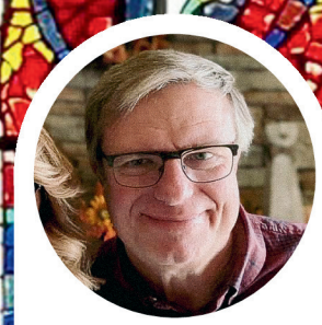
Grace & Peace Senior Pastor